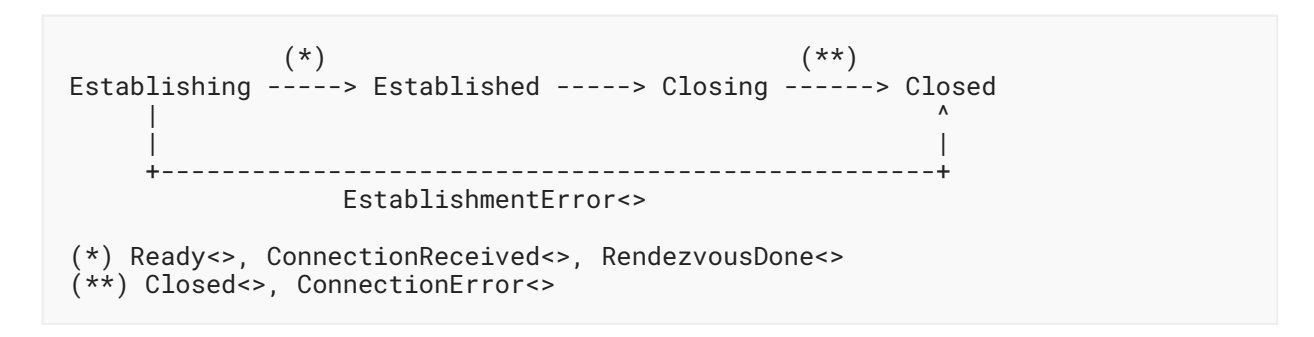
Figure 2: Connection State Diagram

The Transport Services API provides the following guarantees about the ordering of operations: